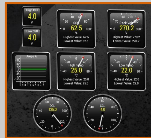
Screenshot of Torque smartphone display